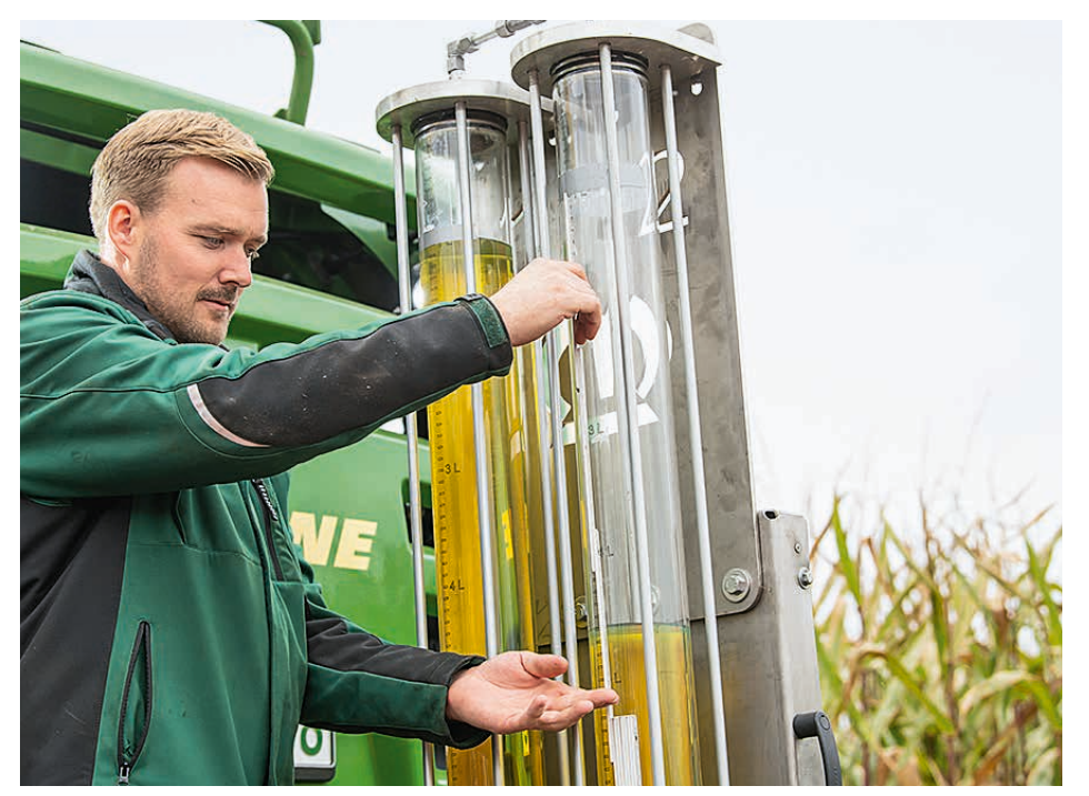
Consumption for each test run was measured with these fuel metering columns.